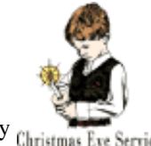
Christmas Eve Service